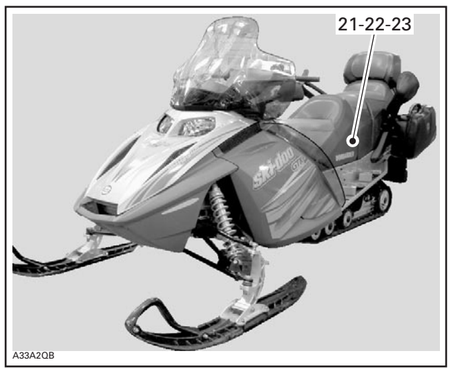
TYPICAL — LOCATION OF IMPORTANT INSTRUCTIONS — REV SERIES

Please read the following instructions carefully before operating this snowmobile.